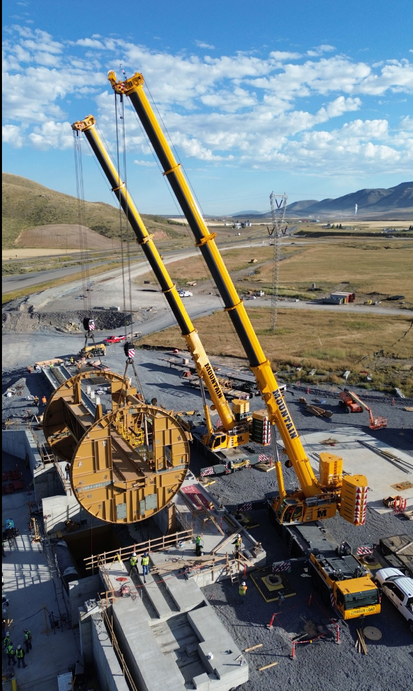
Tandem Pick with Two Liebherr 1350 Cranes

NEED A QUOTE FOR YOUR PROJECT? CLICK HERE!