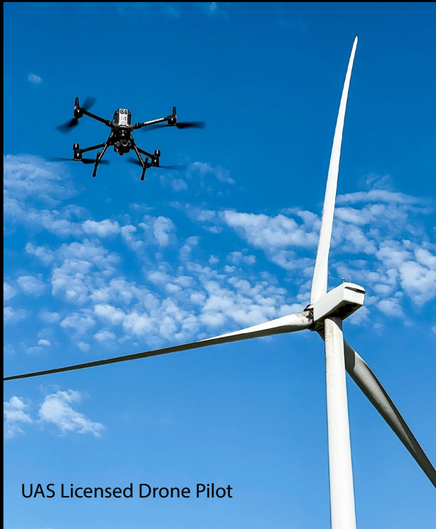
UAS Licensed Drone Pilot

Equipped with state-of-the-art features, Mountain's engineering team is proud to add advanced drone capabilities to our toolkit. The DJI Matrice enables our team to conduct efficient aerial surveys, and identify potential issues in the pre-planning phase of any project.