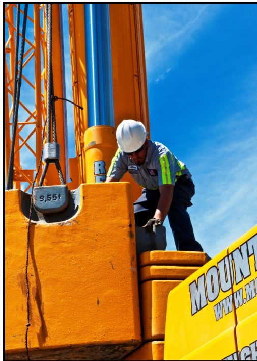
Top: Mountain Crane emblem created to represent the Mountain Crane Law.