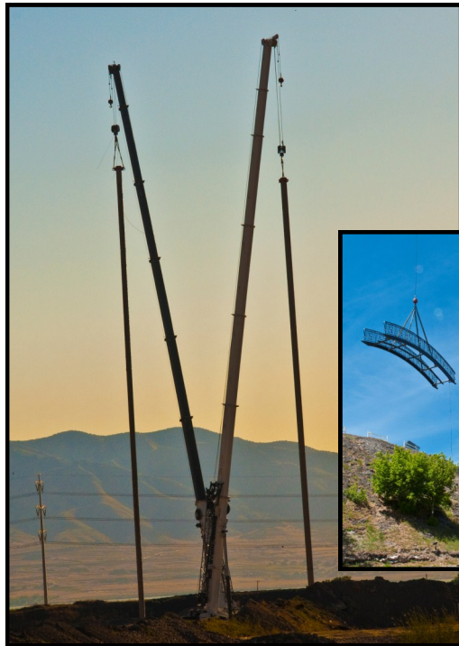
Water Well, Orem

This has been a busy summer for Mountain Crane! Our cranes have been working on many unique projects. From placing bridges, ski resort chair lifts, and water wells, our cranes have successfully completed several projects this last month. Featured below is our Liebherr LTM1160 200 Ton All Terrain at the Homestead Resort as well as the Deer Valley Ski Resort. Two of our 275 Ton All Terrain cranes worked in unison in order to place water wells in Orem, UT.