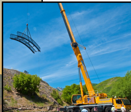
Homestead Resort, Heber

This has been a busy summer for Mountain Crane! Our cranes have been working on many unique projects. From placing bridges, ski resort chair lifts, and water wells, our cranes have successfully completed several projects this last month. Featured below is our Liebherr LTM1160 200 Ton All Terrain at the Homestead Resort as well as the Deer Valley Ski Resort. Two of our 275 Ton All Terrain cranes worked in unison in order to place water wells in Orem, UT.