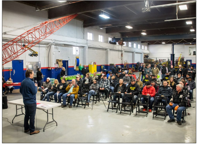
The Mountain Team gathers for a quarterly safety meeting in January

It's the month of LOVE! Being safe is the best way to show family, friends & coworkers your love & respect.